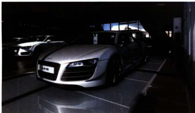
Giltrap Audi's new terminal sports an impressive two-storey aluminium facade and a 17-car showroom. It is an impressive addition to the Great North Road.

Proudly specialising in the sale of new and used Audi vehicles, while boasting the latest technology in its parts and service centre, the terminal invites motorists to experience the ultimate in Audi service.